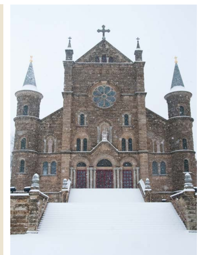
Snowfalls in February and March covered the Archabbey in quiet beauty. More photos of recent events are on Pages 9 and 12.

The Editor, The Development Office, Saint Meinrad Archabbey and Seminary & School of Theology, 200 Hill Drive, St. Meinrad, IN 47577, (812) 357-6501 • Fax (812) 357-6759, news@saintmeinrad.edu www.saintmeinrad.edu, © 2015, Saint Meinrad Archabbey