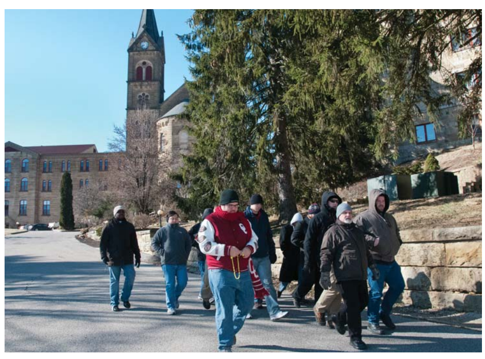
▲ Students make an annual pilgrimage to the Monte Cassino Shrine in thanksgiving for Our Lady's intercession during a smallpox outbreak in 1871.