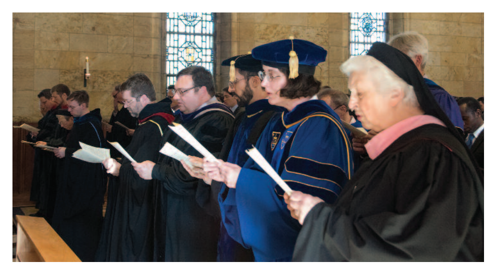
A Faculty members receive a blessing during the opening Mass of fall semester on September 5.