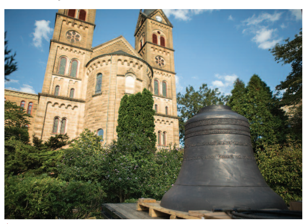
▲ Bell #6 awaits return to the Archabbey Church tower after being repaired in the Netherlands. It was reinstalled on August 9.

For info or to order: Call us at 1-800-325-2511 or visit www.carenotes.com.