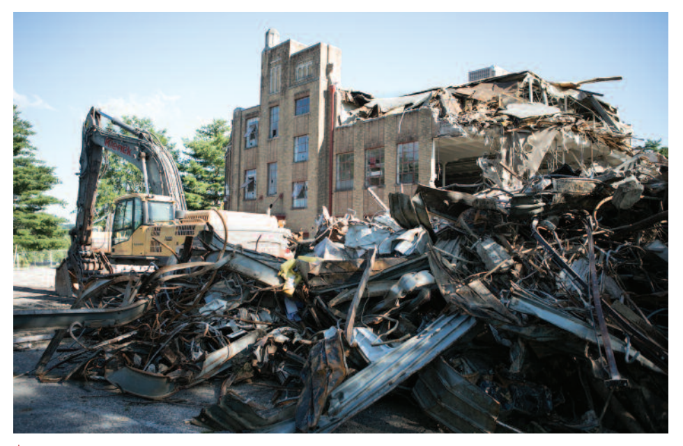
▲ This summer the former Abbey Press Plant 1 was razed and a new greenspace is taking its place. The plant closed in 2017.

The funeral Mass was celebrated on September 25, followed by burial in the Archabbey Cemetery.