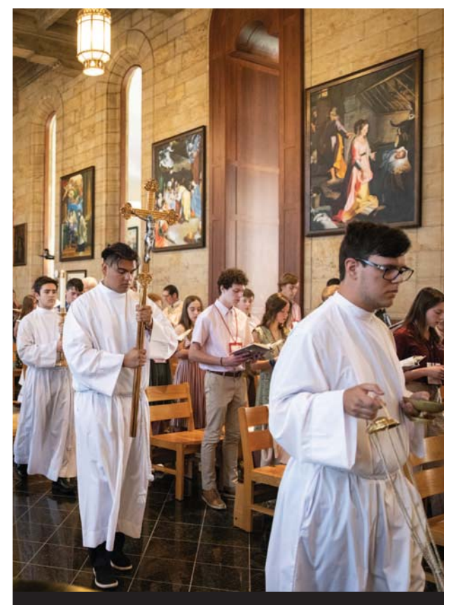
"One Bread, One Cup" participants process into the St. Thomas Aquinas Chapel at the start of the conference closing Mass on July 1, 2022. Find more photos at http://saint-meinrad.smugmug.com

The Editor, The Development Office, Saint Meinrad Archabbey and Seminary & School of Theology, 200 Hill Drive, St. Meinrad, IN 47577, (812) 357-6501 • Fax (812) 357-6759, news@saintmeinrad.edu www.saintmeinrad.edu, © 2022, Saint Meinrad Archabbey