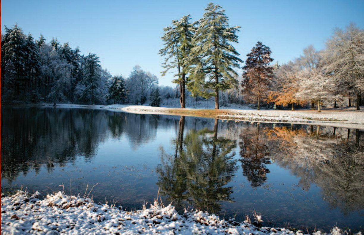
A dusting of snow surrounds a lake at Saint Meinrad Archabbey.